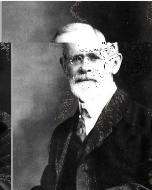
Prof. Cleveland Abbe

lines, and such other duties as officers and men were liable to be called upon to perform.