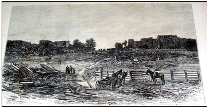
Illustration from Mount Carmel, IL, tornado in 1877.