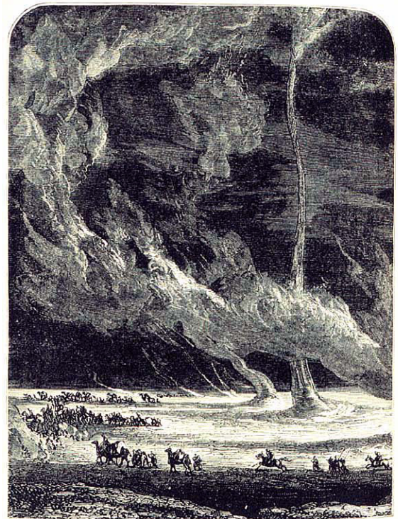
Fig. 64.—Sand whirlwind.

A particularly inconsiderate inspector was checking over the property for which a