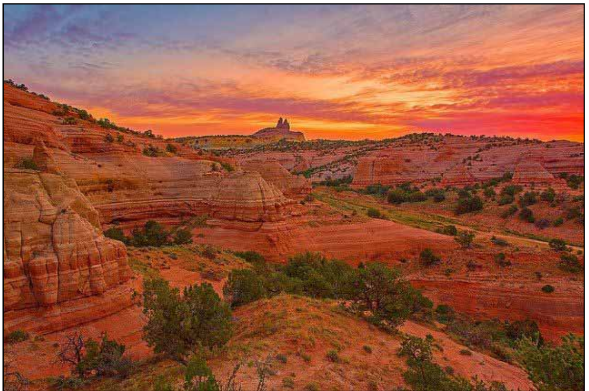
Landscape near Redrock, NM