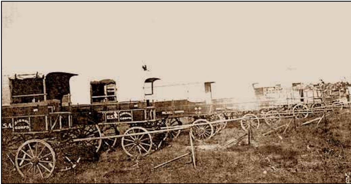
Signal Service transportation at Jacksonville, FL (1898)

party, missing her husband, stirred things up, that the ambulance was sent on its way to our rescue.