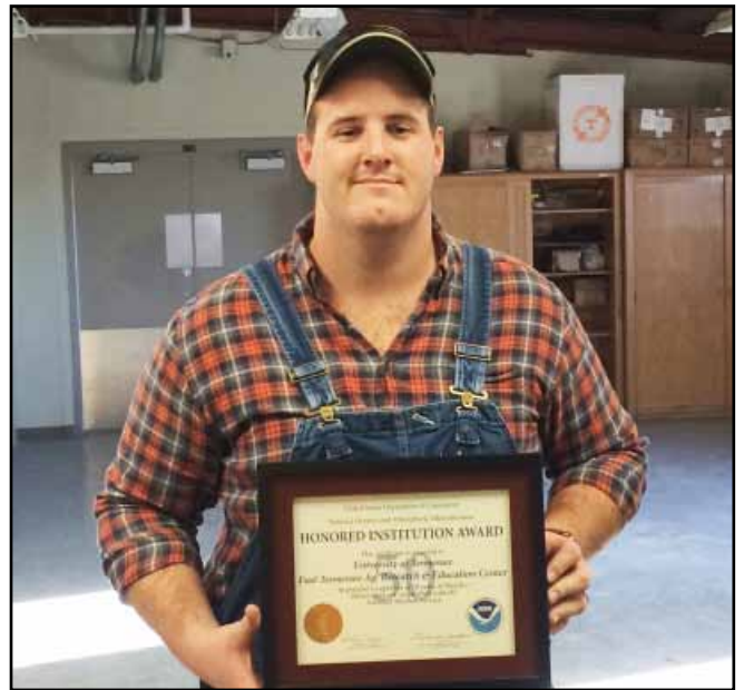
Staff members at Lancaster Water Works in Lancaster, OH, were honored recently for their 50 years of temperature and precipitation observations. Thank You Lancaster Water Works for your dedication and service!