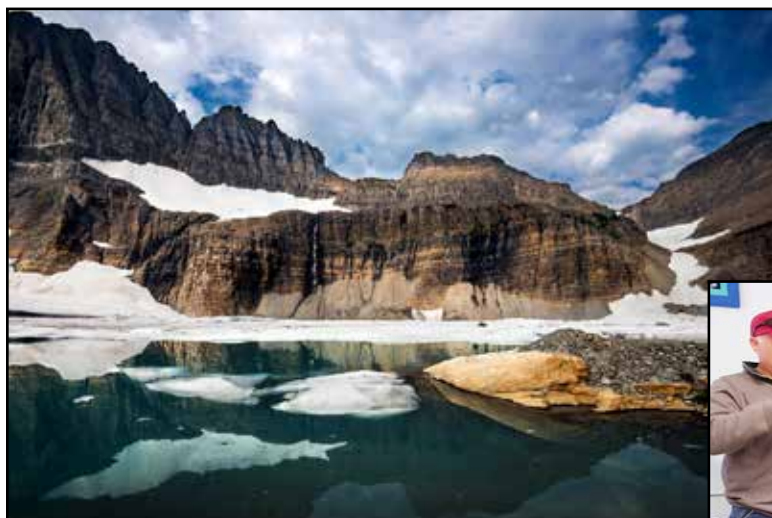
Glacier National Park