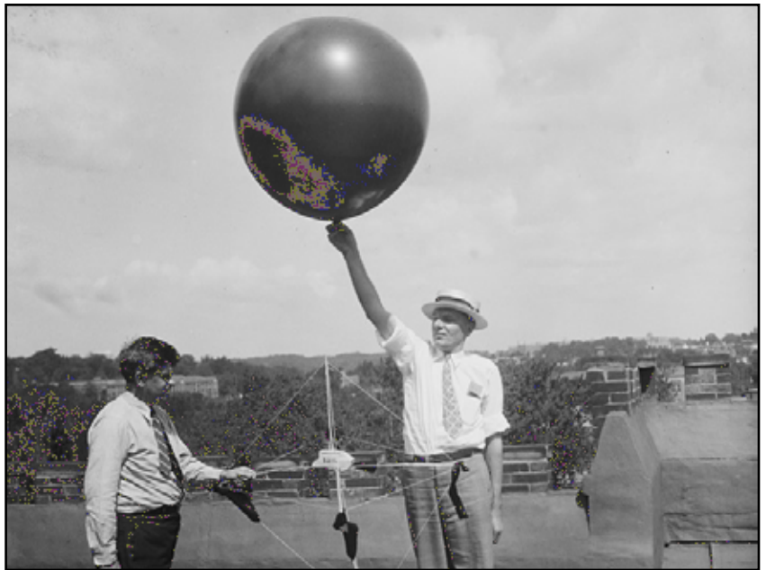
Early launching of weather balloon in Washington, D.C.

Thomas Jefferson and James Madison realized that growth of America depended upon disproving this theory. In addition to