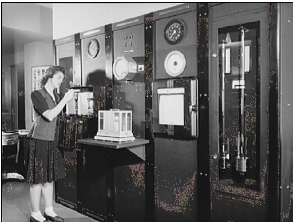
NWS staff member checking surface observations in 1943.

making observations of plants and animals in the New World, they journalized day-to-day weather on their plantations. Weather observations included temperature, barometric pressure, winds, and precipitation.