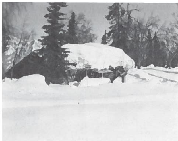
Hayes River, AK, located near the mountains near Rainy Pass approximately 100 miles northwest of Anchorage.

Since the last rendition of the newsletter, the station at Eagle River Visitor Center has been put on inactive status. Budget cuts will determine the reactivation date. The station at Seward 9 NW in the Kenai Fjord National Park was reactivated January 1st. The station at Port Protection, in southeast Alaska, was also reactivated and will be relocated in April when the observer will be leaving to go fishing. Another observer has been located. The station at Skagway was relocated and combined with the aviation station located just north of the cooperative station. Wes and Wanda Self have taken over as both cooperative and aviation observer. We have located observers for the two new stations, the first at Halibut Cove Lagoon, on the south shore of Kachemak Bay and the other at Hollis, in southeast Alaska. We hope to be able to open the stations by spring.