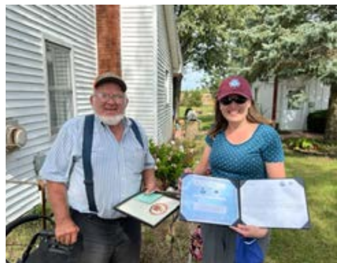
Our dedicated observer in the West Manchester/ Eldorado area has been providing weather observations for 15 years.