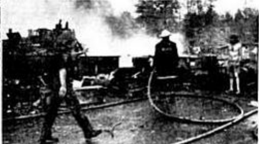
Early damage: Harcourtville, one of the first Simcoe County areas to be hit by a tornado, had its share of extensive damage but no loss of life. Police and firemen were on the scene where a fire broke out, apparently from electrical causes, in the wake of the tractor which trashed down before it hit.