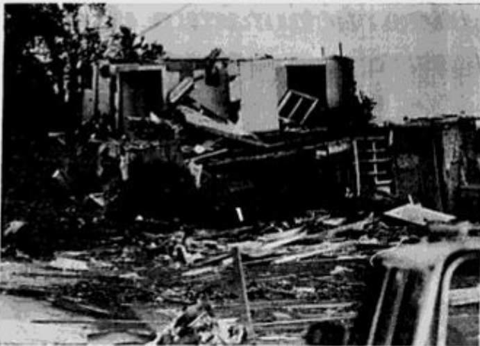
Shattered homes like this were a lonely sight on Silchester Road in Forested Shingle, west of Route 11, before Friday evening's twister.

The twister struck the house from the east, and the house was blown away. The twister struck the house from the east, and the house was blown away.