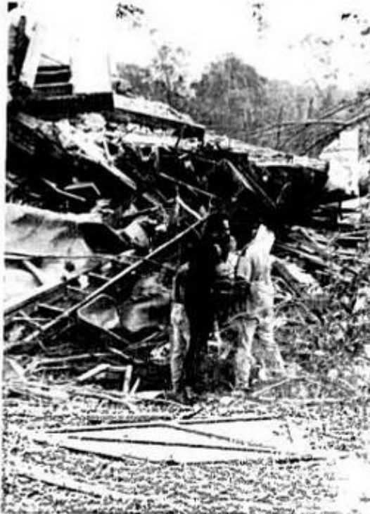
Where to start? A shocked Simcoe County law enforcement officer reached for assistance as he and rescue workers began the task of moving rubble in an effort to reach a woman trapped underneath ruins of the United Post Mall store on Thompsonville, between Road 422, one of the areas hit most heavily when the tornado struck near Perryton, the day of June 27, 1985, except for the home, which was recovered.