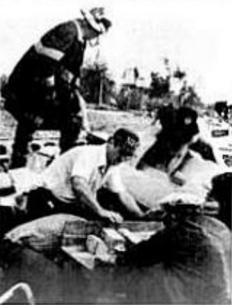
Rubble search: Police, firemen and volunteers worked with little luck in an effort to reach a woman trapped underneath ruins of the United Post Mall store on Thompsonville, between Road 422, one of the areas hit most heavily when the tornado struck near Perryton.