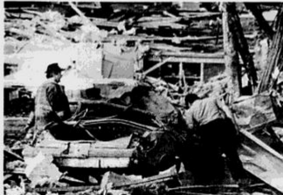
Relief work... destroyed building... aftermath of the storm...