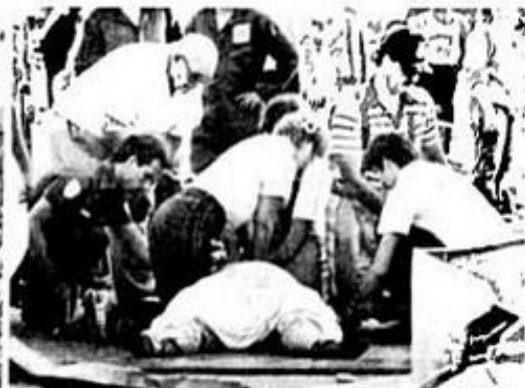
Rubble efforts: Paramedics worked hard to rescue a woman who was buried beneath heavy beams of the Post Park Plaza but their efforts were in vain.