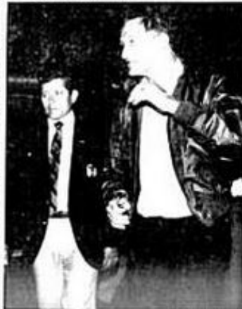
Governor on the scene: Ont. Gov. Robert F. Gibbons arrived Friday night to inspect the havoc created in many Simcoe County areas by the tornadoes. He stated several disaster headquarters, and promised all possible help from the state. It was nearly 2 a.m. when the governor, still riding from a lobby show, flew back to Columbia.