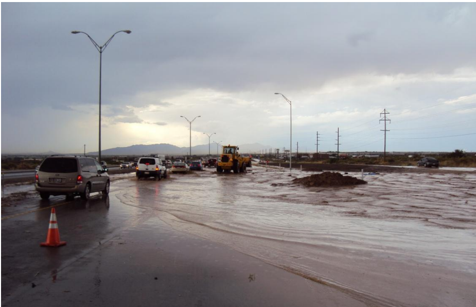
Heavy rains flood Interstate 10 near Horizon City on September 11.

August 23: Heavy rains cause minor flooding around Mescalero and Poverty Creek NM.