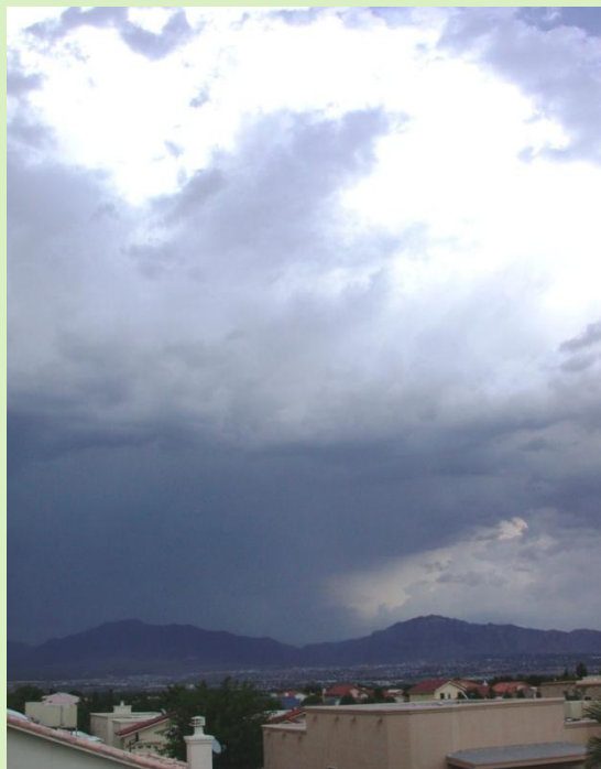
Strong thunderstorm over El Paso on July 16.

July 2: Evening thunderstorms dump heavy rains over portions of southern New Mexico including 2.5 inches of rain falling at Mountain Park in Otero County. Some flooding is reported across Highway 82.