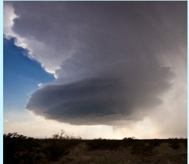
Hailstorm moving near Tornillo TX.

During the afternoon of September 16, two supercell thunderstorms struck El Paso County dropping large destructive hail. The first storm produced golf ball-sized hail when it moved southeast across Hueco Tanks State Park in largely unpopulated areas. The second supercell however proved to be the most destructive hail storm in the county's history when it dropped hail up to the size of tennis balls from El Paso International Airport southeast to Tornillo. The hail damaged numerous motor vehicles, homes and businesses with damage estimates of $150 million.