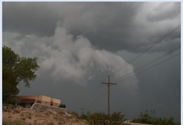
July 3 thunderstorms with heavy rains also drench the Las Cruces area.