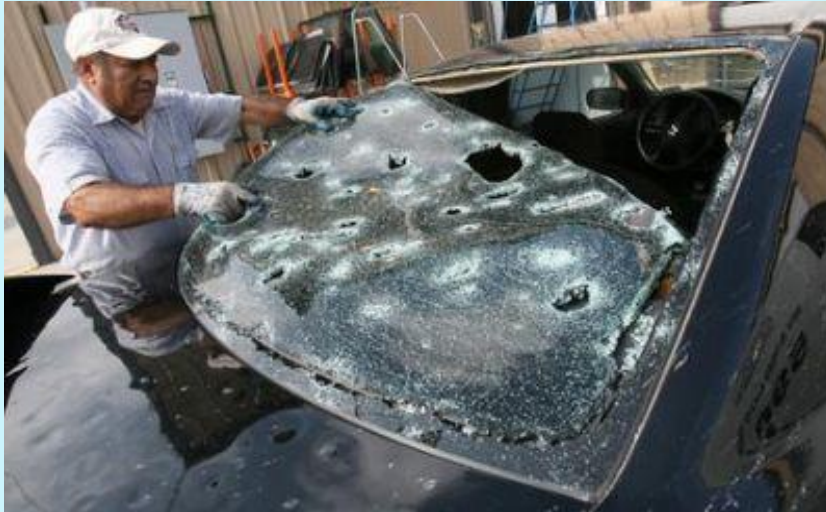
Tennis ball-sized hail caused widespread damage across the El Paso area on September 16.

During the afternoon of September 16, two supercell thunderstorms struck El Paso County dropping large destructive hail. The first storm produced golf ball-sized hail when it moved southeast across Hueco Tanks State Park in largely unpopulated areas. The second supercell however proved to be the most destructive hail storm in the county's history when it dropped hail up to the size of tennis balls from El Paso International Airport southeast to Tornillo. The hail damaged numerous motor vehicles, homes and businesses with damage estimates of $150 million.