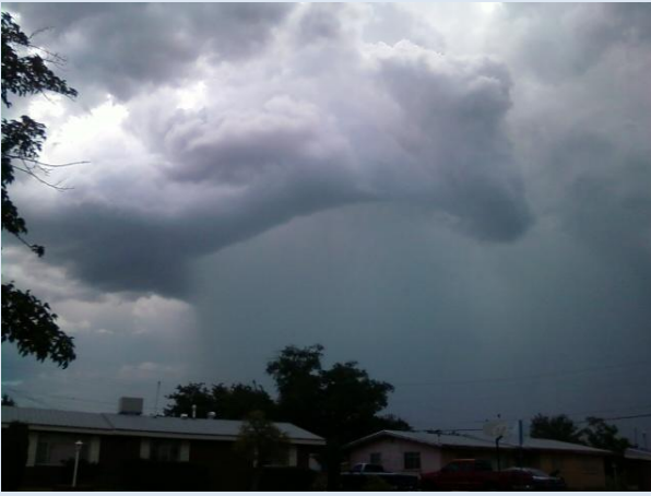
This thunderstorm produces torrential rains over east El Paso on June 22. (Kim Fuller)