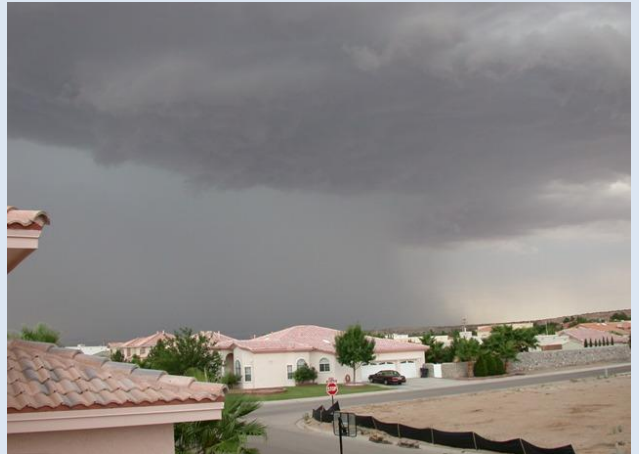
A thunderstorm with heavy rains, small hail and cloud-to-ground lightning moves into Santa Teresa on July 3.