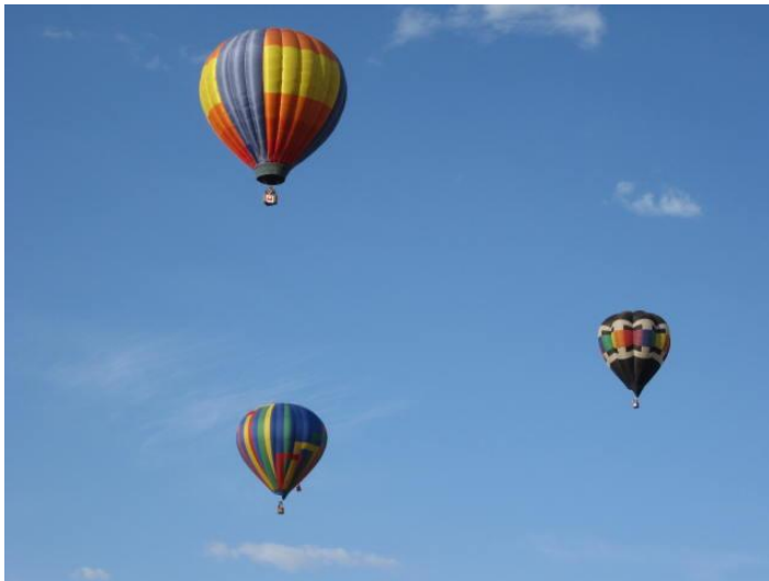
Warm, dry and mostly sunny weather during the spring of 2009 was favorable for numerous outside activities including the Albuquerque Balloon Festival. (Diane Green)