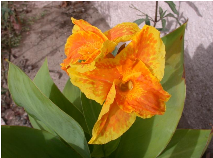
Flowers bloom after late summer heavy rains. (Charlotte Rogash)