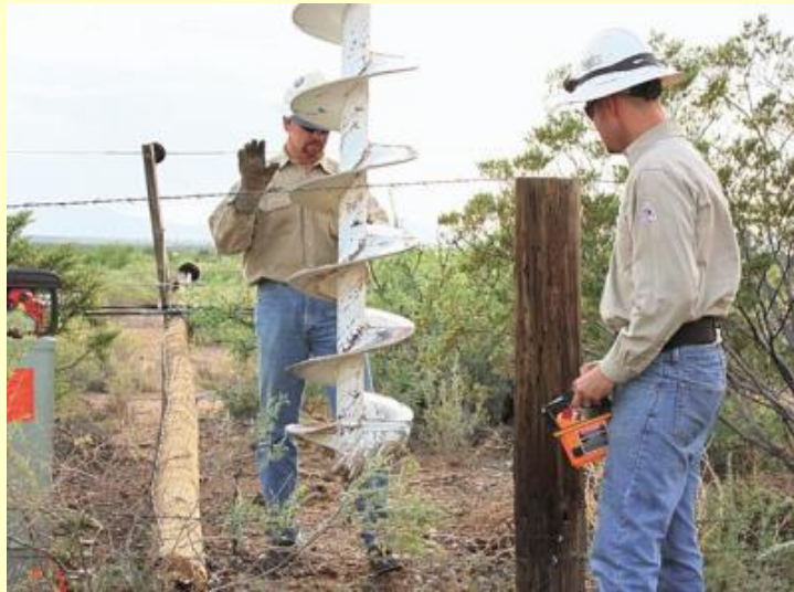
Utility workers repair power lines blown down during the August 4 severe thunderstorms at Boles Acres.

July 21: Severe thunderstorms bring 60 mph winds and marble-sized hail to La Luz in Otero County.