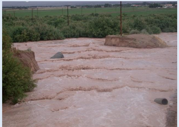
Heavy rains on July 3 cause this arroyo to overflow in Santa Teresa.

June 24: Severe thunderstorms produce 62 mph wind gusts and almost an inch of rain over portions of White Sands Missile Range.