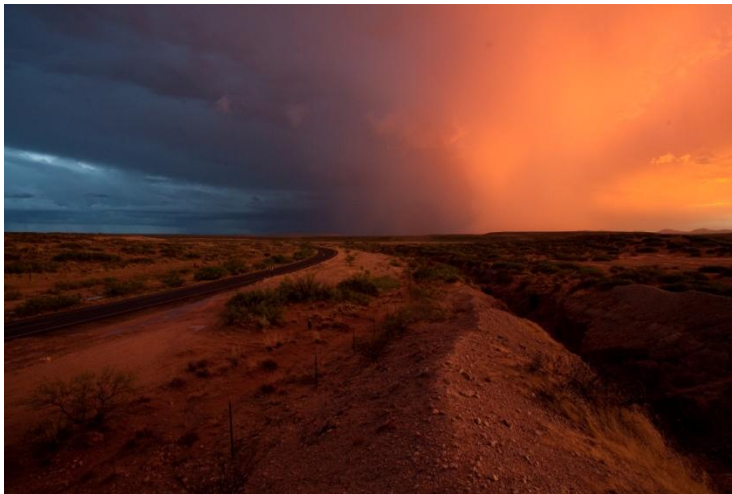
Sunset thunderstorm near Columbus NM.