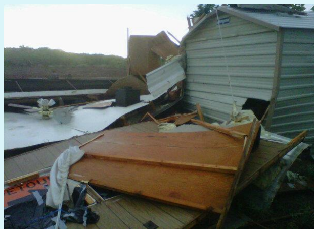
Gila NM property damage. (Loretta Brown)