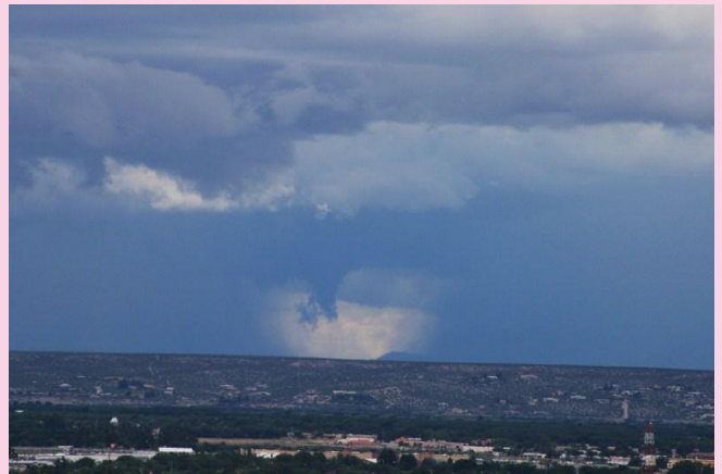
Thunderstorm with heavy rains fall around Las Cruces on July 31. (Jeff Passner)

July 25-26: Evening and early morning showers and thunderstorms dump torrential rains across the Las Cruces area. New Mexico State University records a record 3.36 inches of water with numerous buildings, homes and streets flooded around Las Cruces, Mesilla and Dona Ana. Floodwaters