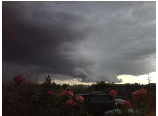
On August 24 thunderstorms drop heavy rains across Dona Ana County.

August 15: Nickel-size hail and minor wind damage occur near Animas NM when evening severe thunderstorms move across Hidalgo County.