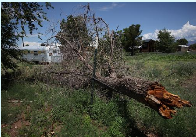
Pine tree blown down.

A large pole barn was destroyed and damage occurred to other buildings and property in the vicinity. In addition the winds uprooted a pine tree and flattened vegetation.