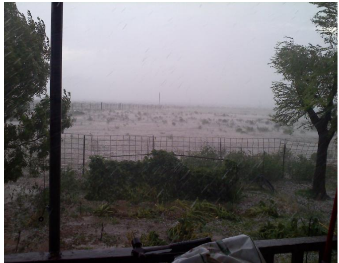
Large hail falls over Animas NM on August 15. (Shannon Lasher)

August 13: Severe thunderstorms strike the Fabens TX area. High winds blow down 4 light poles with hail also reported.