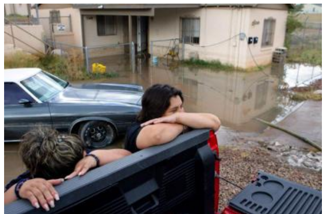
September 22-23 heavy rains flood portions of east El Paso.