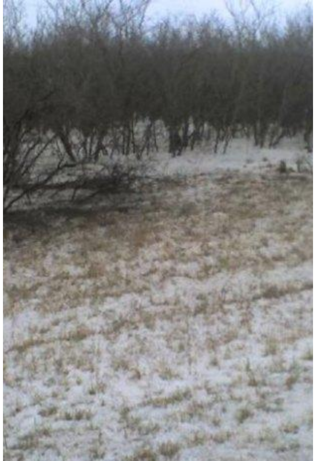
Courtesy pictures from Robert Gonzales located 3.5 miles west of the Texas Highway 16/Farm and Market Road 140 intersection, between Christine and Charlotte in Atascosa County.