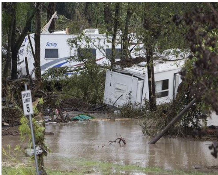
Flood damage in the Shady River RV Park near Georgetown.

On Wednesday afternoon the deep tropical moisture left over from Hermine triggered another band of showers and thunderstorms that became nearly stationary across portions of the eastern Hill Country. During the afternoon, these storms over southwest Bexar County and southeast Medina County produced flash flooding near Natalia where up to 8-10 inches of rain fell over a few hours time.