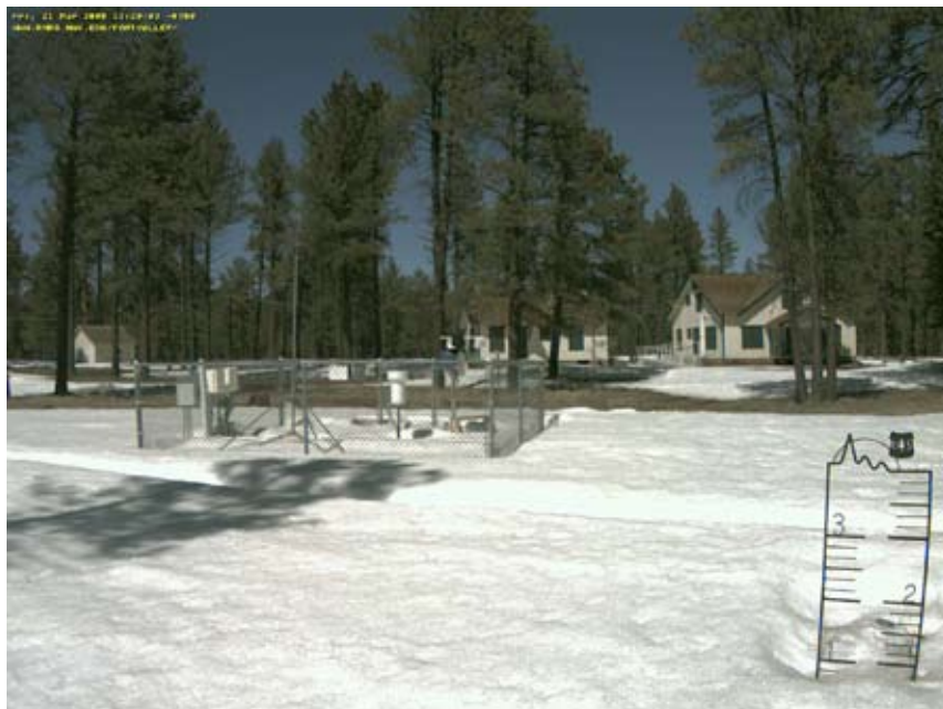
FVEF weather station as it is now. March 21, 2008.