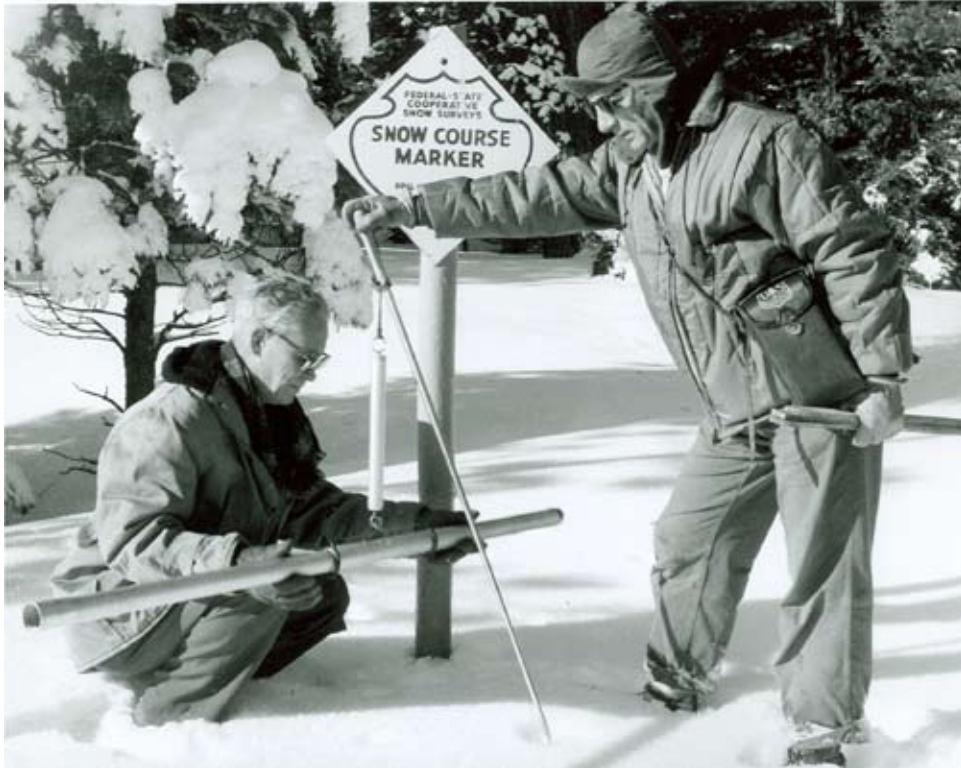
Arizona snow survey. 1965 photograph.