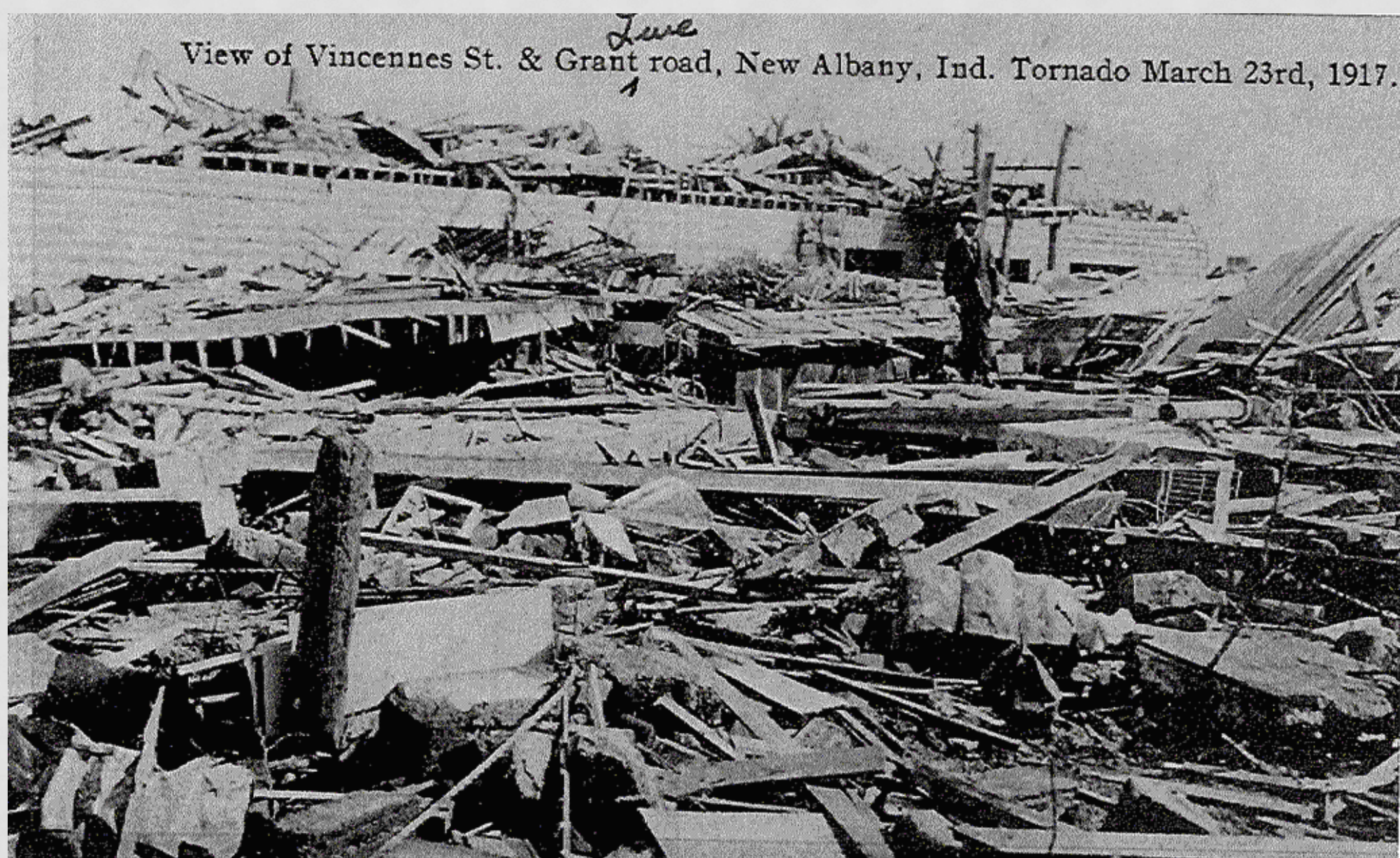
The Kahler Plant was destroyed by the tornado. Six employees were killed and 15 were injured.