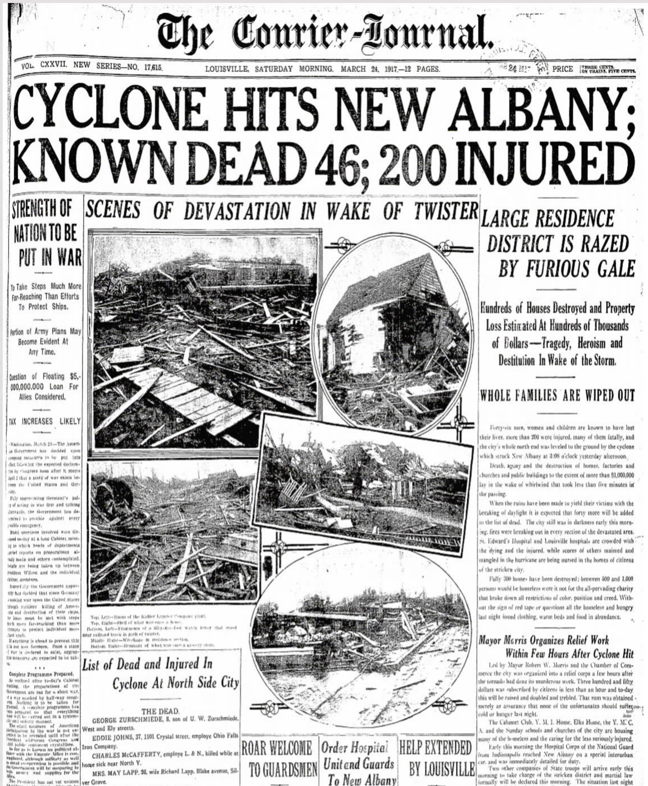
Front page of the Courier Journal the day after the tornado.

News about the tornado spread fast. Within an hour of the storm hitting, help from Louisville and surrounding towns arrived in New Albany. The Red Cross and National Guard worked around the clock helping those affected by the storm.