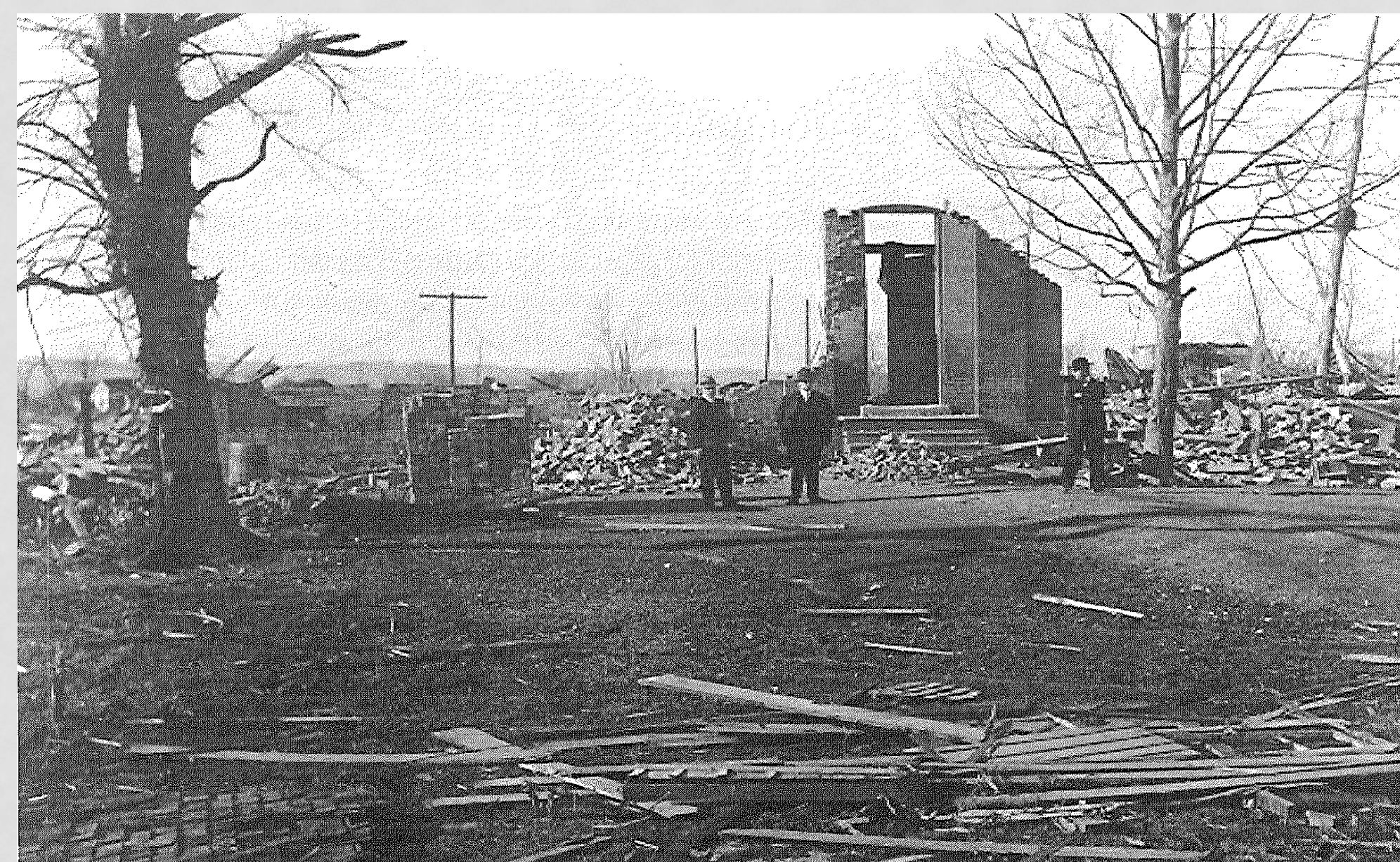
Ruins of the Olden Street School where at least 5 (possibly 12) students died.