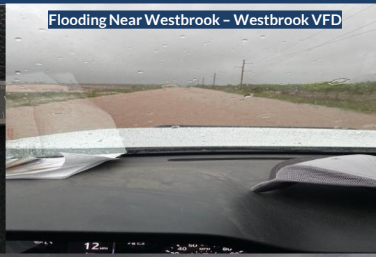
Flooding Near Westbrook

Gustnado