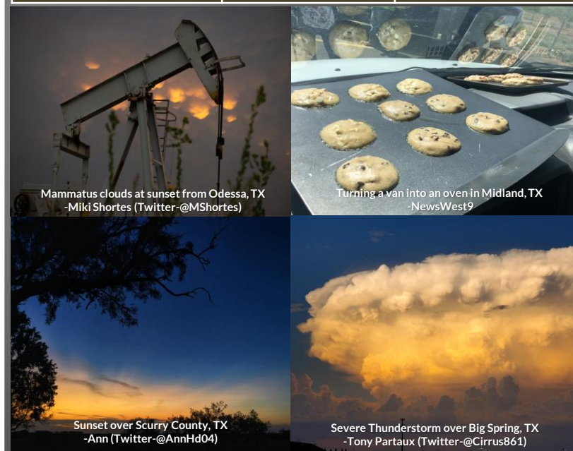
Mammatus clouds at sunset from Odessa, TX