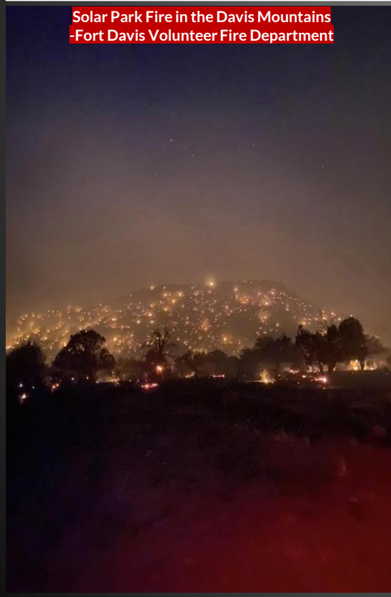
Solar Park Fire in the Davis Mountains