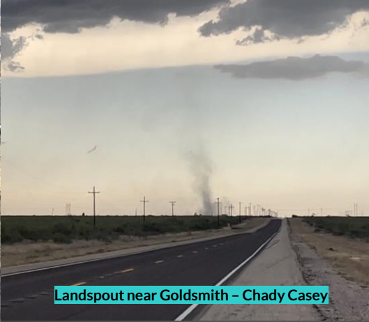
Landspout near Goldsmith - Chady Casey