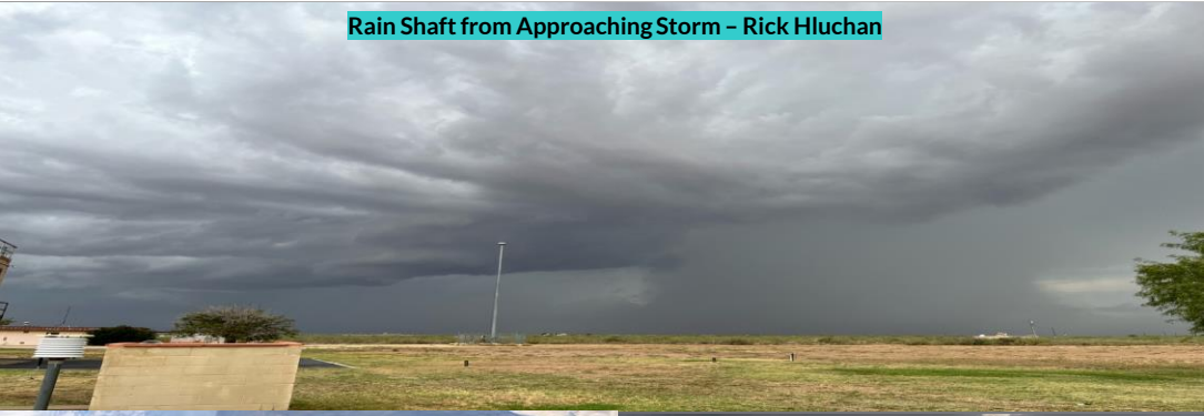
Rain Shaft from Approaching Storm - Rick Hluchan