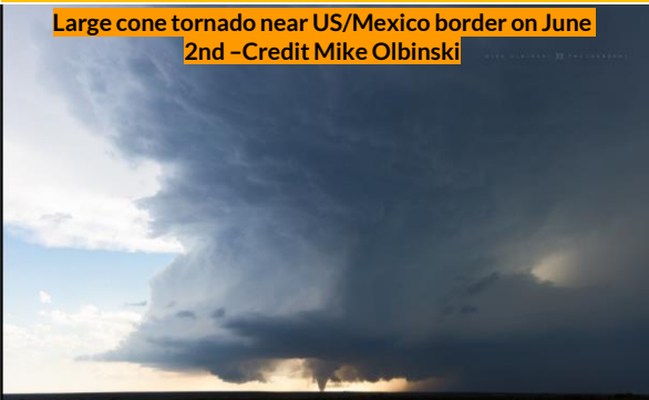
Large cone tornado near US/Mexico border on June 2nd