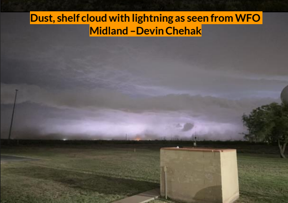
Dust, shelf cloud with lightning as seen from WFO Midland - Devin Chehak