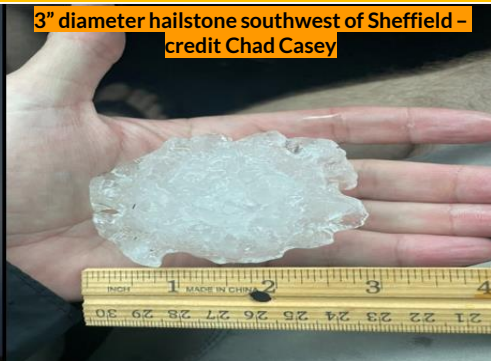
3" diameter hailstone southwest of Sheffield