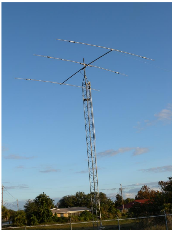
CL-33 rotatable beam