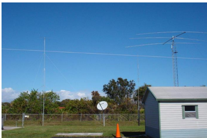
Gap Voyager and 20M Yagi beam