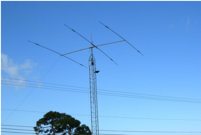
CL-33 Rotatable Beam