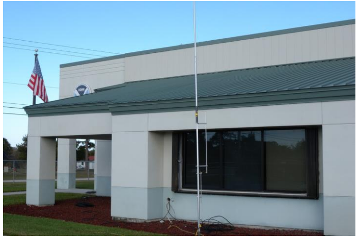
Gap 20M Vertical