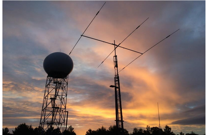
KMLB WSR-88D Radar and CL-33 Rotatable Beam