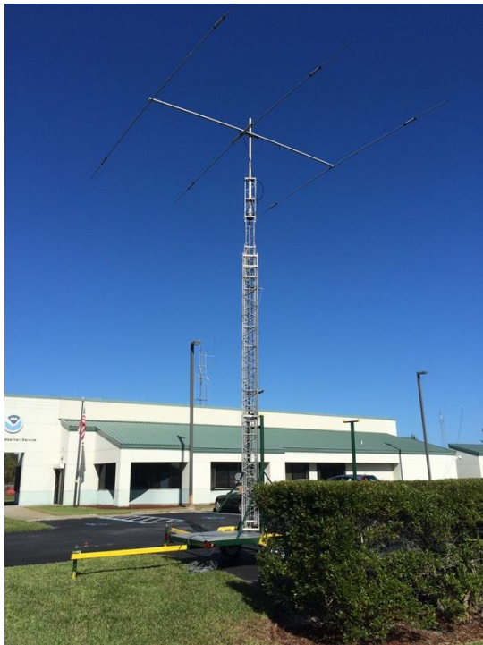
CL-33 Rotatable Beam