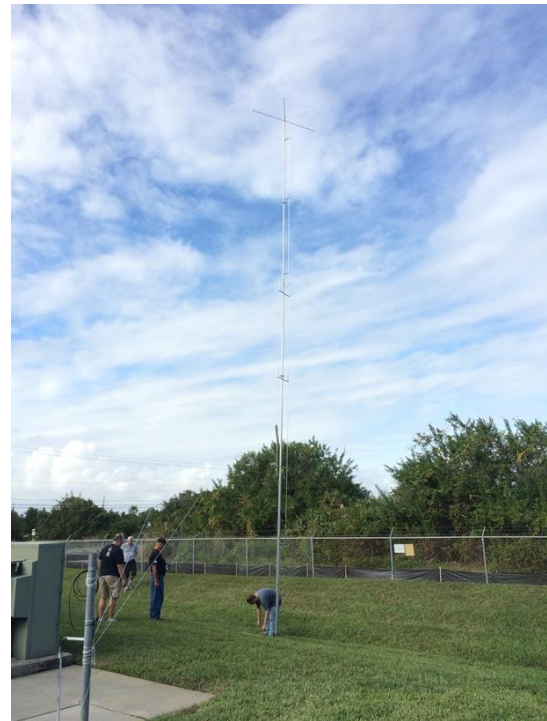
Setting up the GAP Voyager