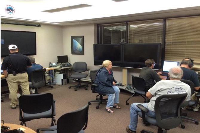
HF Operations in Conference Room