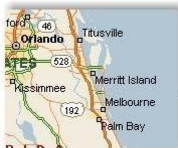
Approximate track of tornado through northwestern Palm Bay, Florida

The Storm Prediction Center (SPC) in Norman, OK outlooked peninsular Florida with a slight risk of severe storms with their day 2 outlook early on Saturday February 26. A significant increase in winds through the atmosphere was expected during the afternoon of the February 27 as the upper level wind maxima pulled just to the north of the NWS Melbourne forecast area. By midday with a tornado watch in place, SPC and local assessment showed an increasing likelihood of supercell thunderstorms along with wind damage potential over east central Florida.