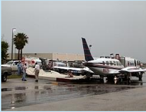
Hangar door blown out.