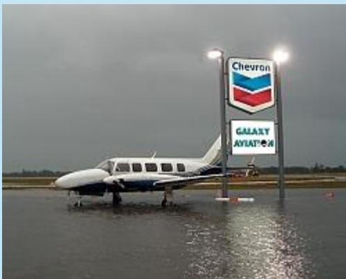
Aircraft was moved by winds.