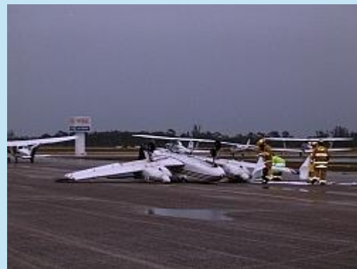
Damaged Aircraft at Witham Field.