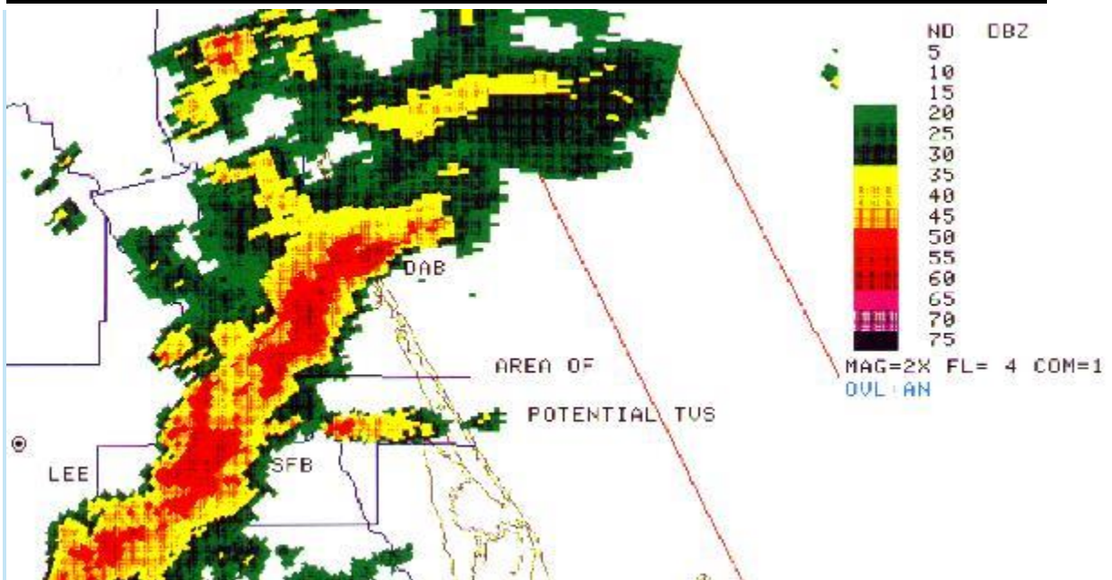
Reflectivity display of associated severe thunderstorm. Note the "inflow notch". (b-ref/.5 deg/2132z)