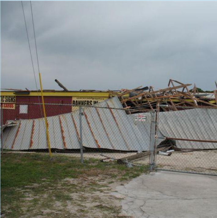
Cocoa/Port St. John/Frontenac