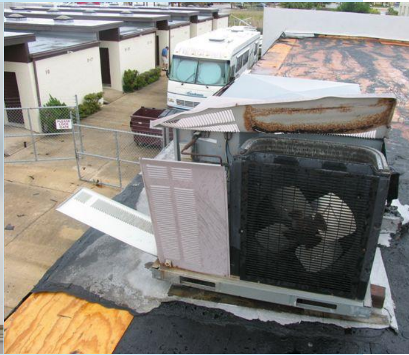
North Merritt Island