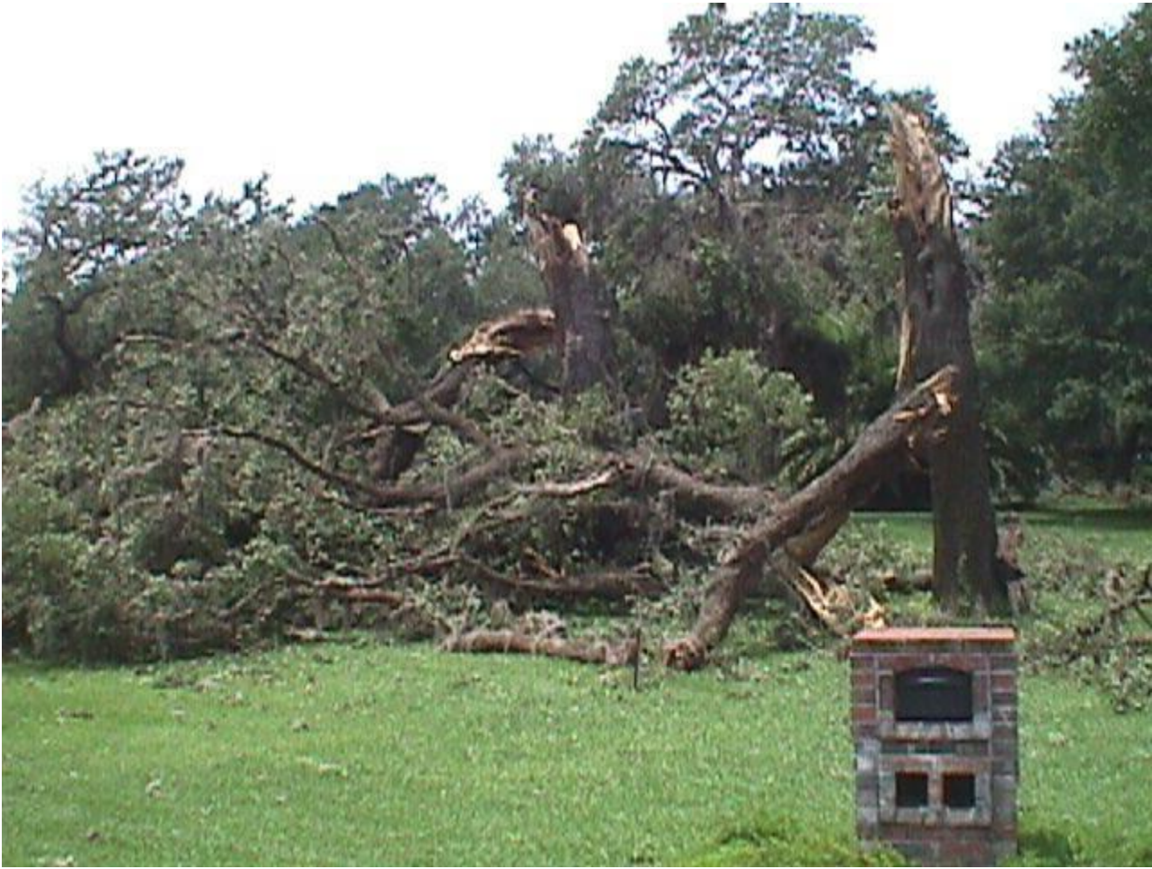
Location 2. Large oaks sheared.