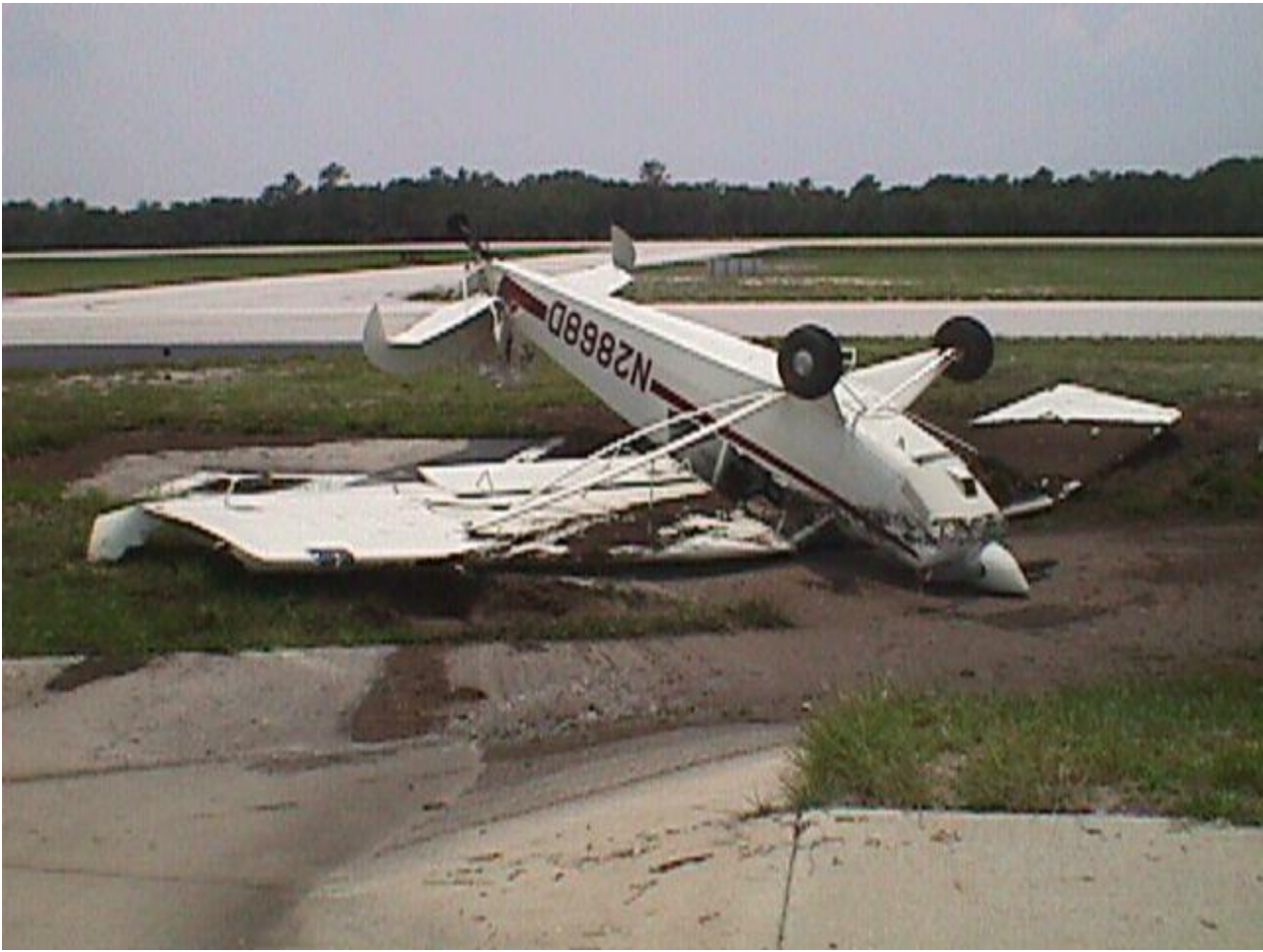
Location 4. Plane flipped.