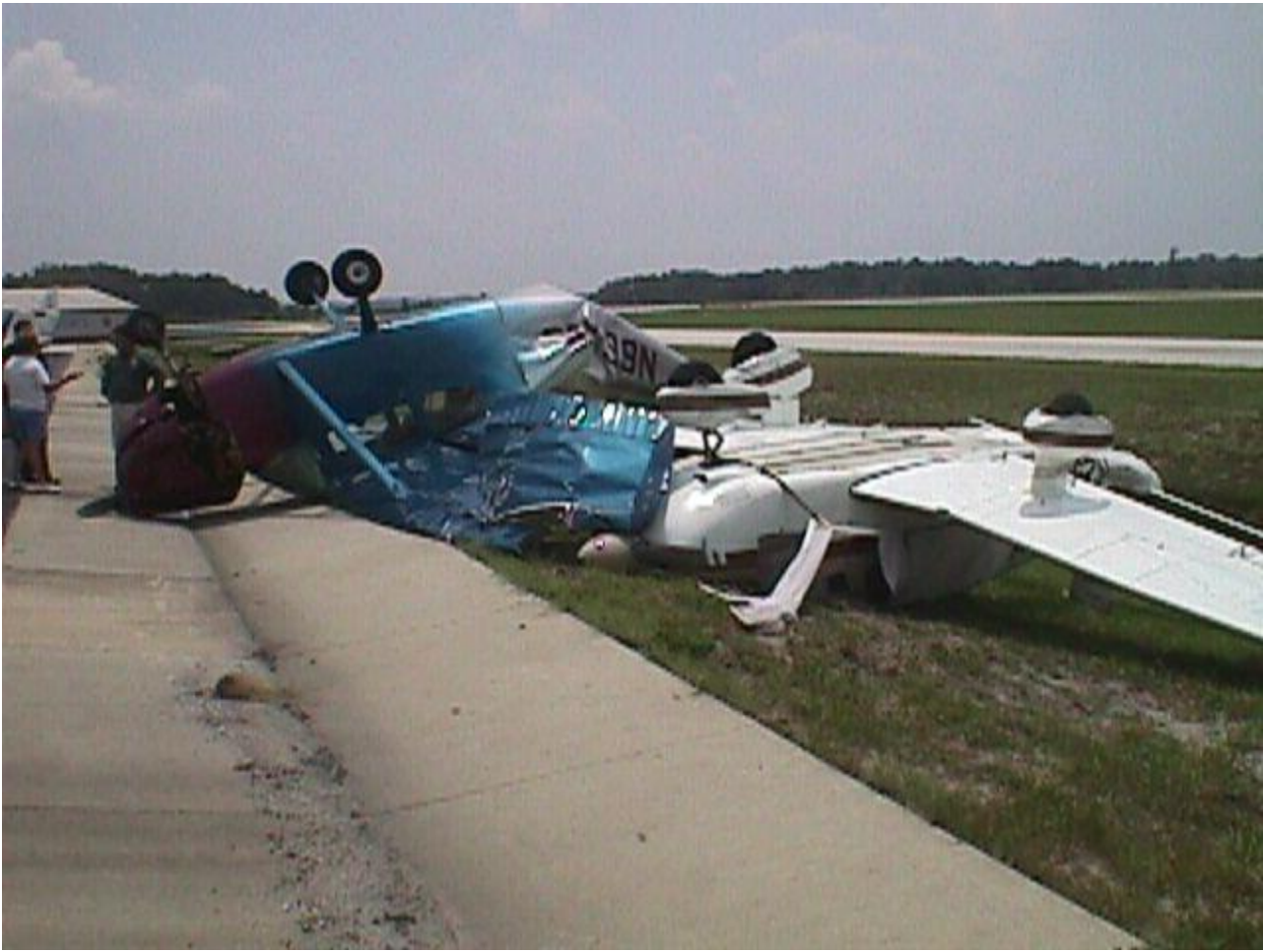
Location 5. 2 planes twisted together.