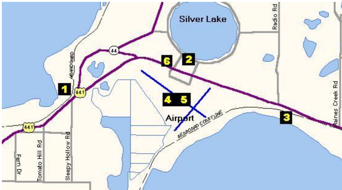
Leesburg damage map area with photo locations indicated.