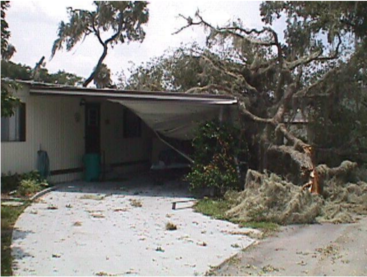
Location 3. Carport crushed by tree.