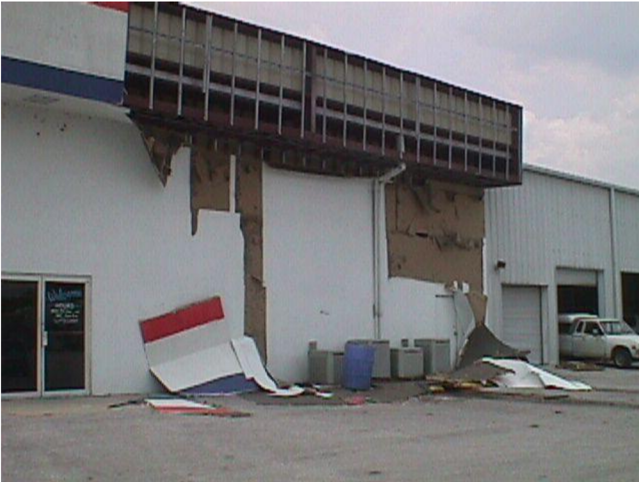
Location 6. Building fascia removed.