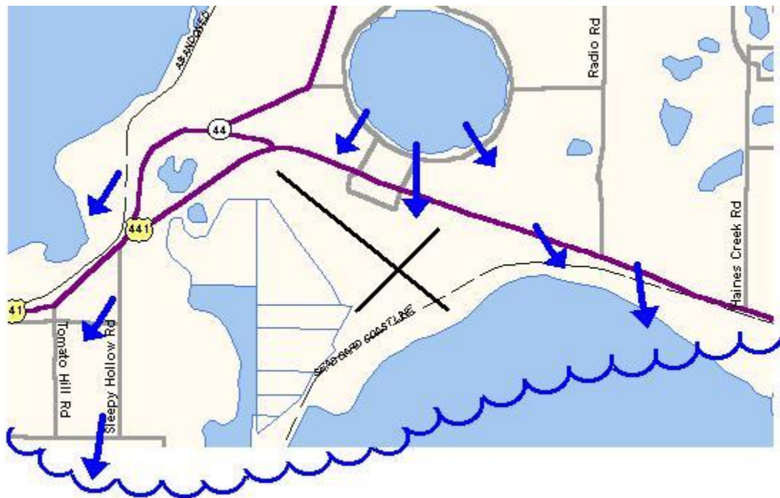
Conceptual diagram of macroburst over damage area, based on survey and interpretation of radar imagery.