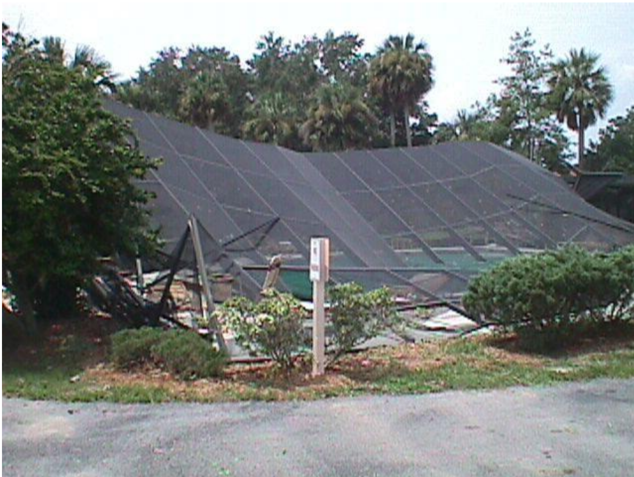
Location 1. Pool enclosure destroyed.