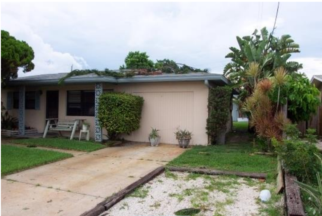
Debris on Roof