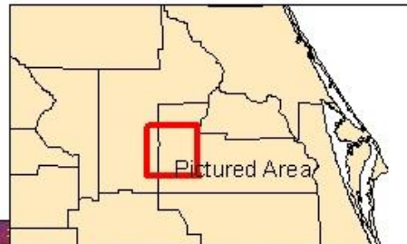
Winter Garden Damage Plots August 4, 2005

Around 7 o'clock on August 4th, a severe thunderstorm developed over Lake Apopka and swept a damaging downburst of winds off the lake and into Winter Garden. Several mobile homes immediately on the lakeshore were damaged. Further into town, a large tree was downed and the awning was ripped from a business on highway 50.