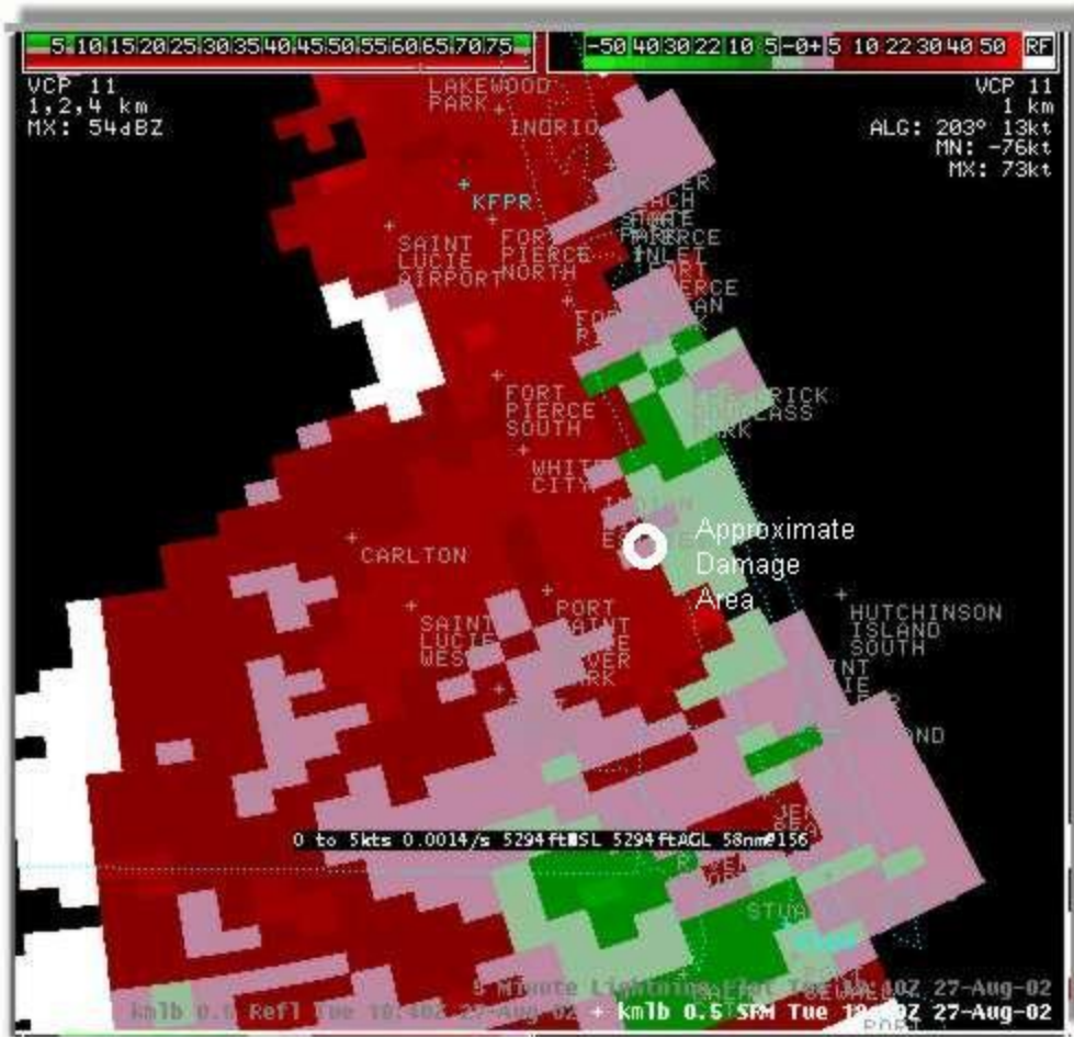
Storm Relative Motion at 1940z (2:40 PM)