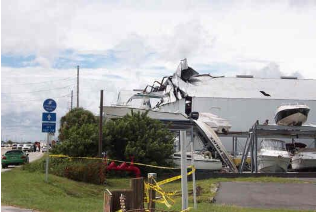
Damage at Anchorage Yacht Basin

National Hurricane Center Summary of Gabrielle