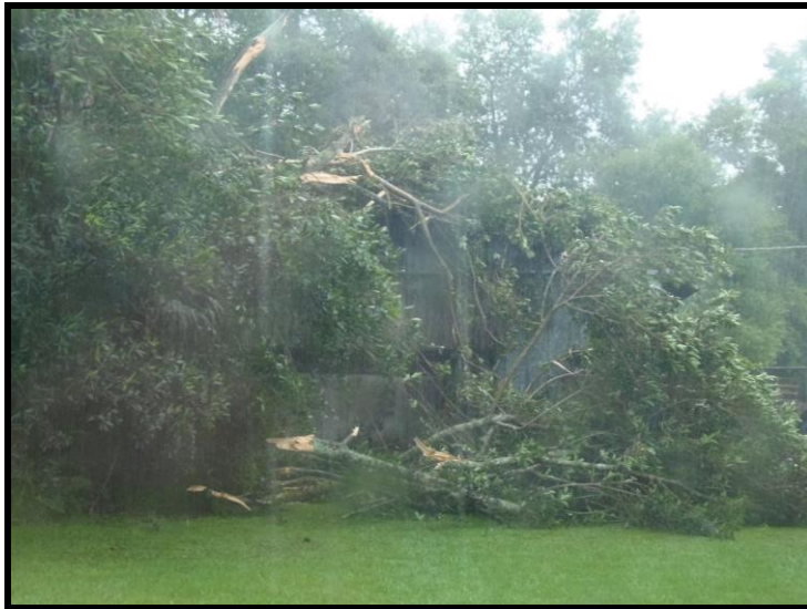
Palm City