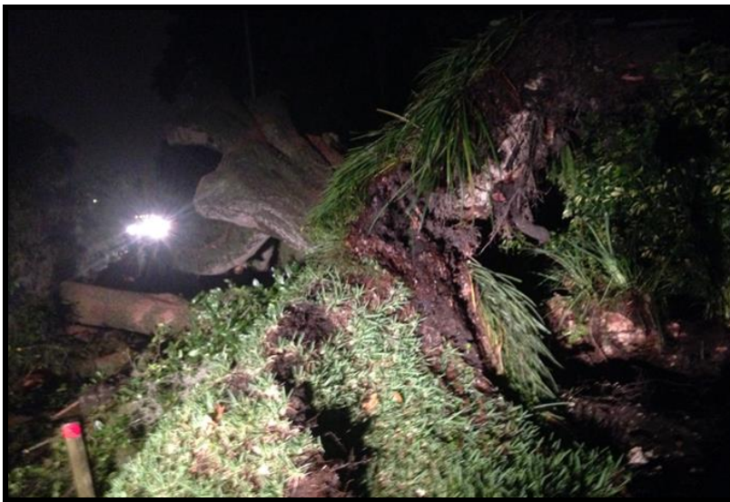
Winter Park