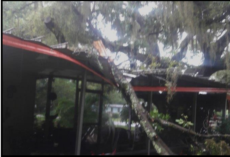
Lockhart area of Orange Co (CFN13)