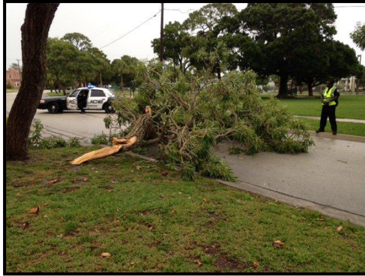
Hayes Road, Fort Pierce

Some tree/branch damage occurred in the metro Orlando area and along the Treasure Coast. The following pictures of damage are courtesy local media outlets WPTV and CFN13: