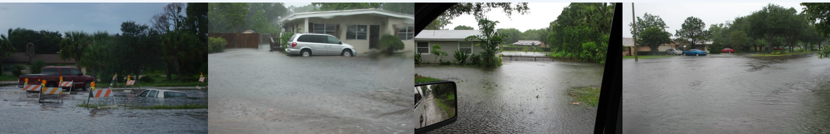
Various pictures of flooding in Melbourne