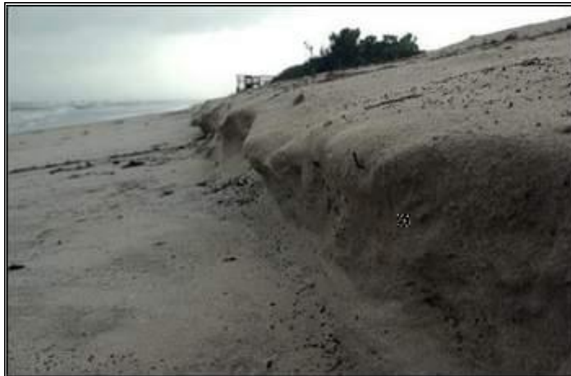
Ophelia's primary impact was beach erosion

National Hurricane Center Summary of Ophelia (pdf)