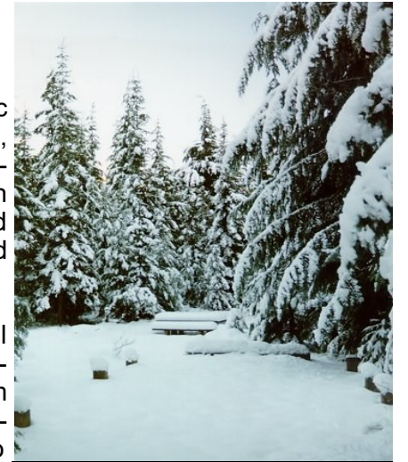
Colville National Forest, Pend Oreille County

A storm earlier in the week had left relatively cool air over the region with surface temperatures below freezing. In addition, the strength of the storm while over the Pacific created an "offshore", easterly surface pressure gradient that continued to pull cooler surface air into the region from southern BC. Moist and relatively warmer air in the mid levels of the atmosphere streamed in from the southwest ahead of the main storm setting up a classic "overrunning" precipitation event for the area.