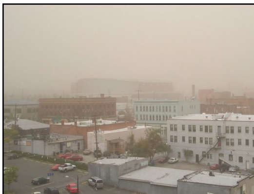
Dust in the skies over Spokane. These pictures was taken near the Spokane Arena. The one on the left was taken around 2:30 pm, while the one on the right was taken just 2 hours later around 4:30 pm.