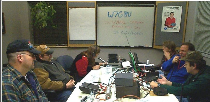
The Spokane County ARES/RACES Skywarn group hard at work on Skywarn Recognition Day on Dec. 7th.