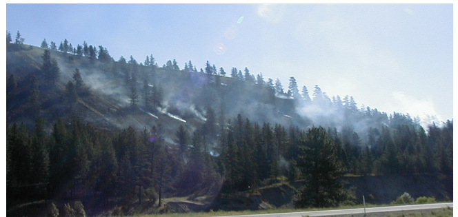
The side of South Hill in Spokane on 6/27/03

Concerns for a busy 2003 fire season in the Inland Northwest were justified with below normal mountain snow pack and a warm and dry late spring. With the season now winding down, hindsight shows a number of serious fires did occur, but the number of acres burned did not approach the large numbers recorded in 1994 and 2001. The weather played a critical role in limiting lightning related starts with a strong ridge in place for much of the summer. Any thunderstorms that did cause fires seemed confined to the US-Canada border areas from the North Cascades to the Okanogan and North Idaho. The Inland Northwest did experience one or two smoke episodes, primarily from fires in northwest Montana and southern British Columbia. ☼ John Livingston