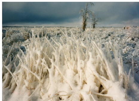
A peek of things to come. Are you ready?

Email: Robert.Bonner@noaa.gov Phone: 244-0110 x 225