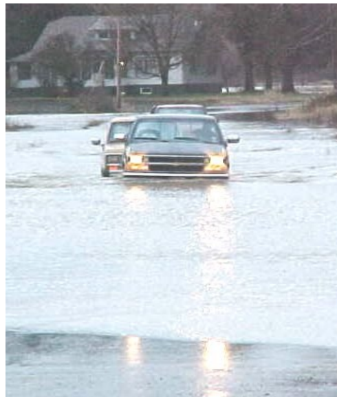
Flooding on Flannigan Road near Potlatch, ID. Luckily these drivers were safe, but driving through at least 2 feet of water can sweep most vehicles away! Please, avoid water covered roadways.