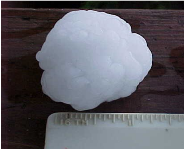
Hail measuring one and half inches in diameter (ping pong ball size) observed in Otis Orchard on 6/10/03 by Bob Lutz.

MARCH After our mild El Niño winter, the spring of 2003 was a little on the cool and wet side. The month of March started off with a distinct cool spell, including some lowland snow in a few areas. Spokane airport picked up measurable snow on 3 of the first 9 days of the month, including a 1.2" snowfall on the 9 th . Then the flow aloft quickly switched to the southwest and temperatures warmed rapidly. On the 13 th highs were in the mid 60s and even lower 70s. The remainder of the month was a typical mixed-bag of weather. On the whole though, March was a bit warmer than normal, continuing the warm trend that existed since October 2002.