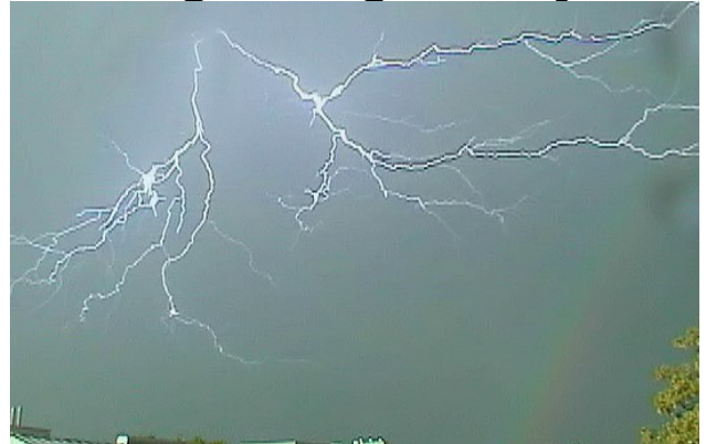
Lightning over Washington State University on June 10th.