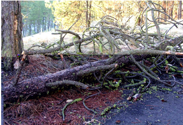
Tree damage seen around south Spokane from Nov. 19th

Between 6 and 7 am, the reports of damaging winds ranging from 60 to 70 mph began to pick up with local media calls of trees falling on houses and widespread power outages throughout Spokane. The Spokane airport measured a 63 mph gust, only 4 mph short of the all time record of 67 mph set in 1972. By 8 am, the focus of damaging winds moved into the Coeur d'Alene area. The highest gust at the Coeur d'Alene airport was 55 mph with widespread reports of fallen trees across the area.