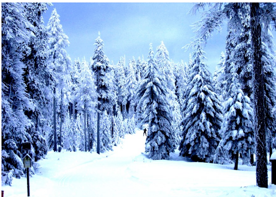
A View at Mount Spokane in early December 2005.

Thanks to this active winter storm track; there is no sign of a drought and above average snow packs have returned to mountain locations across the Inland Northwest. The east slopes of the Washington Cascades have benefited from these storms with plenty of snow. This deep snow pack will lead