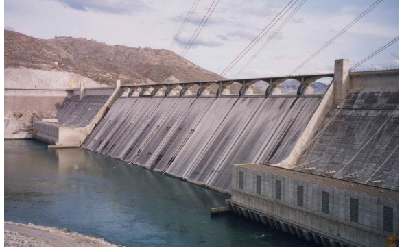
A view of the Grand Coulee Dam

The Grand Coulee Dam, located on the Columbia river in central Washington, is the largest concrete structure in the United States. It forms the centerpiece of the Columbia Basin Project, a multi-purpose endeavor managed by the U.S. Bureau of Reclamation. In addition to producing up to 6.5 million kilowatts of power, the dam irrigates over half a million acres of the Columbia river basin farm land and provides abundant wildlife and recreation areas. By strictly regulating the Columbia's highly variable flow rate, the dam provides much needed flood control to the river basin.