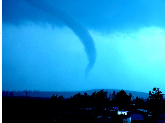
The F1 tornado in Airway Heights 5/21/04.

How does this impact the Inland Northwest? On average, eastern Washington and north Idaho see about 1 tornado a year, and almost every county in