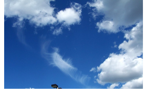
Cold air funnel near Riverside on August 27th

SPOTTER REPORTS: 244-0435 or espotter.weather.gov