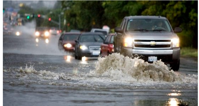
Flooding on Mission and Orchard Ave in Wenatchee on July 28th.

August in general was a quiet month, weather-wise, with near-normal temperatures. Thunderstorms on