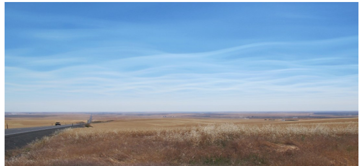
Smoke over the Palouse on August 25th.

So how cool was the summer of 2010? Here's a few numbers to help quantify it: