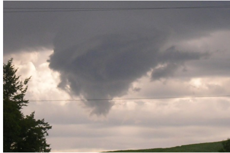
Wall cloud near Colton on June 23rd.