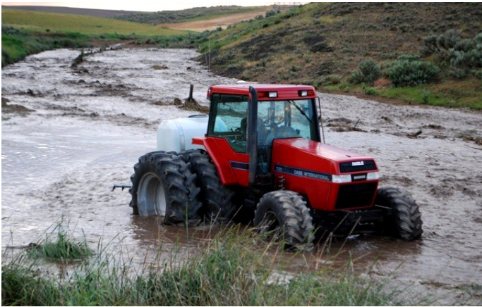
Flooding off of Highway 2 near Hartline on June 23rd.

J une continued the wet pattern that had set up in late May. Nearly everyday during the first two-thirds of the month daytime temperatures were at or below normal. Daily rainfall records were set at several sites. Widespread heavy rain fell on the 2 nd . More than 2" of rain fell in the Panhandle Mountains and Lewiston had 0.87" of rain. After temperatures had warmed into the 70s and lower 80s on the 13 th , a cold storm system dropped temperatures into the 50s on the 16 th . Spokane only reached a high of 52°F while Pullman topped out at 51°F as widespread rain once again fell. Another wet storm system brought heavy rain to the region on the 20 th and 21 st , this lead to many locations receiving more than a half inch of rain. As the weather warmed again, thunderstorms developed. One storm complex moved through the Hartline area (north of Moses Lake) on the 23 rd , bringing quarter-sized hail up to 6 inches deep, strong winds and flash flooding.