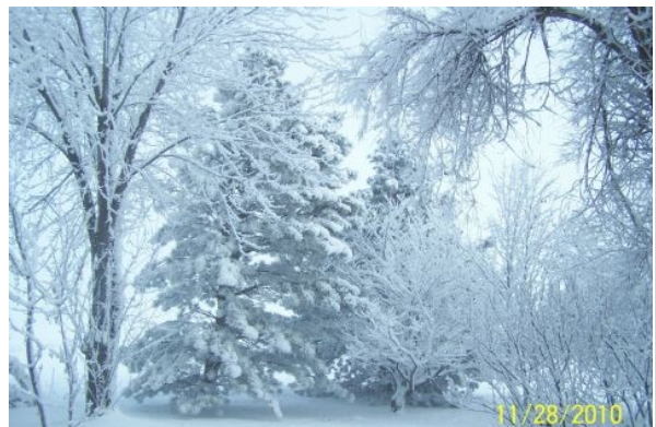
Wintry Thanksgiving weekend in Odessa.

An equally impressive storm approached the area from the northwest on the 22 nd , and prompted the issuance of blizzard warnings for many locations. The combination of heavy snow and strong winds caused many Columbia Basin roads to drift shut. Some snowfall reports included 9.7" at Newport, 11" at Anatone, 9" at Colfax, and 12" at Moscow. In its wake, cold air dropped the temperatures below zero at many locations. Record low temperatures on the 24 th were set at Lewiston (-1), Omak (-6), Ephrata (-14) and Pullman (-10). More snow was on the way for the Thanksgiving holiday weekend through the end of the month. The storm on the 30 th brought 10" to Sandpoint, 7.6" to Palouse, and 6.6" to North Spokane. Spokane set a snowfall record for the month of November with 25.9". ☀ Ron Miller