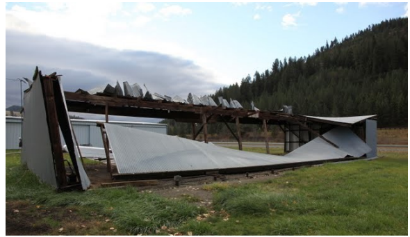
Strong winds on November 16 near Lewiston.

The mild weather of October gave way to a much harsher November . Colder air lowered snow levels to bring the first low elevation snow to the valleys of the eastern Cascades. The last gasp of mild fall weather came in the middle of November, as Wenatchee set a record high temperature on the 14 th of 61°. A very impressive cold front moved into the Inland Northwest