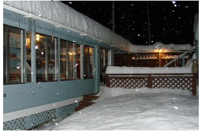
Heavy snow in Waterville on December 12.