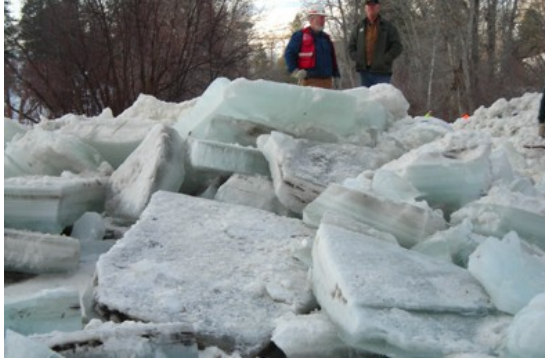
Ice jam breakup on Poorman's Creek February 2009.

Heavy snowfall and frigid temperatures, followed by a sudden warm spell can increase the risk of flooding from snow melt