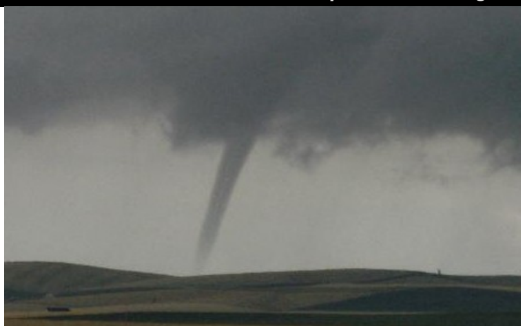
The rare tornado from the Camas Prairie on October 7.

244-0435 or 1-800-483-4532 or espotter.weather.gov