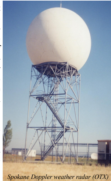
Spokane Doppler weather radar (OTX)

For updated information and training on the Dual-pol radar upgrade, please visit http://bit.ly/oSle80 and http://bit.ly/eaRUqv . ☀ Ronald Miller