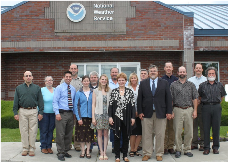
NWS Spokane staff with Dr. Jane Lubchenco (front & center)

On June 29th, Dr. Jane Lubchenco paid a visit to the Spokane NWS office. She has been the Under Secretary of Commerce for Oceans and Atmosphere and the Administrator of NOAA since 2009. Dr. Lubchenco toured the weather forecast office and was able to meet most of the staff. She is a marine ecologist and environmental scientist by training and former professor for over 20 years at Oregon State. ☀