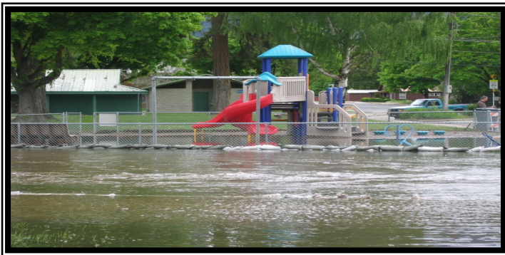
Chewelah creek flooding in Chewelah on May 27th.