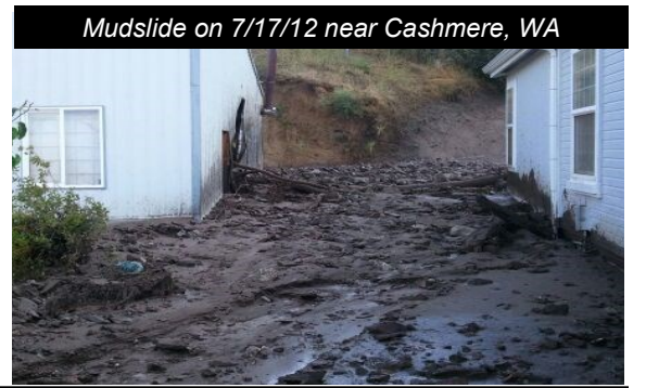
Mudslide on 7/17/12 near Cashmere, WA