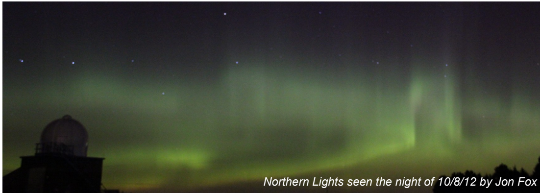
Northern Lights seen the night of 10/8/12

During the late evening hours on October 8th, much of the Inland Northwest was treated to a spectacular atmospheric show of light. The nighttime sky which would typically be filled with little other than stars, was dramatically enhanced by pulsing curtains and waves of green and red light. These lights, referred to as Aurora Borealis or the Northern Lights, are the direct result of the collision between charged particles in the upper atmosphere or energy originating from the sun. The solar energy in this case is tied to a Coronal Mass Ejection (CMEs), which is simply a huge bubble of gas discharged from the sun toward the earth via the solar wind. Typically this light producing interaction takes place near the Earth's poles, or generally between 60° and 70° latitude. However during intense CMEs, this light show can be seen in temperate latitudes such as those in Washington and north Idaho. The strength of the CME is measured by something called the Kp index. Kp index values can range from 0 (calm energy) to 9 (intense energy). For the Northern Lights to be visible at our latitude in the Inland Northwest, we need to