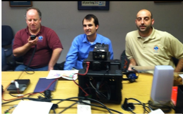
The NWS Spokane forecasters at Skywarn Appreciation Day 12/1/12 .