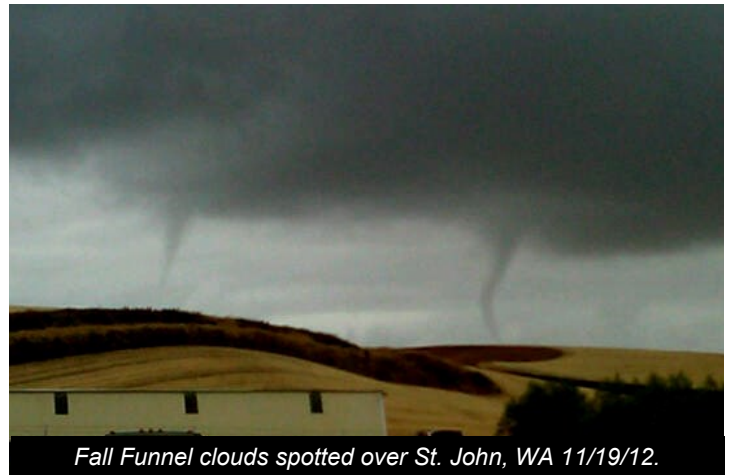
Fall Funnel clouds spotted over St. John, WA 11/19/12.

November turned out to be a rather active weather month. Numerous waves of precipitation moved through the Inland Northwest with very few dry spells. Spokane Airport measured precipitation on 17 of the 30 days. The month started with mild temperatures. Low temperatures